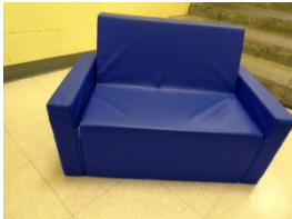
Blue Couch ( 2 available) W 30 ½" x D 18" x H 20" (to top of back of couch)