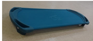
sample single Lg