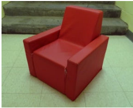
Red Chair W 18 ½" x D 18" x H 20 ¼" (to top of chair back)